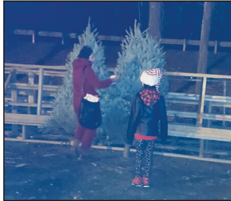
Isaiah 58 Family selecting their Christmas tree.

homes along with tree stands, toppers, lights, ornaments and other decorations. There were crafts for the kids and cocoa and seasonal treats for all. We even had a special visitor from the North Pole! We thank everyone who came together to make this night so special and look forward to making this an annual tradition.