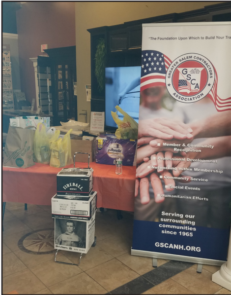
Donations collected at the Member Hosted Event plus $120 cash!!! Thank you!!!

turkey and all the trimmings for 25 families and your help and donations are both needed and very much appreciated.